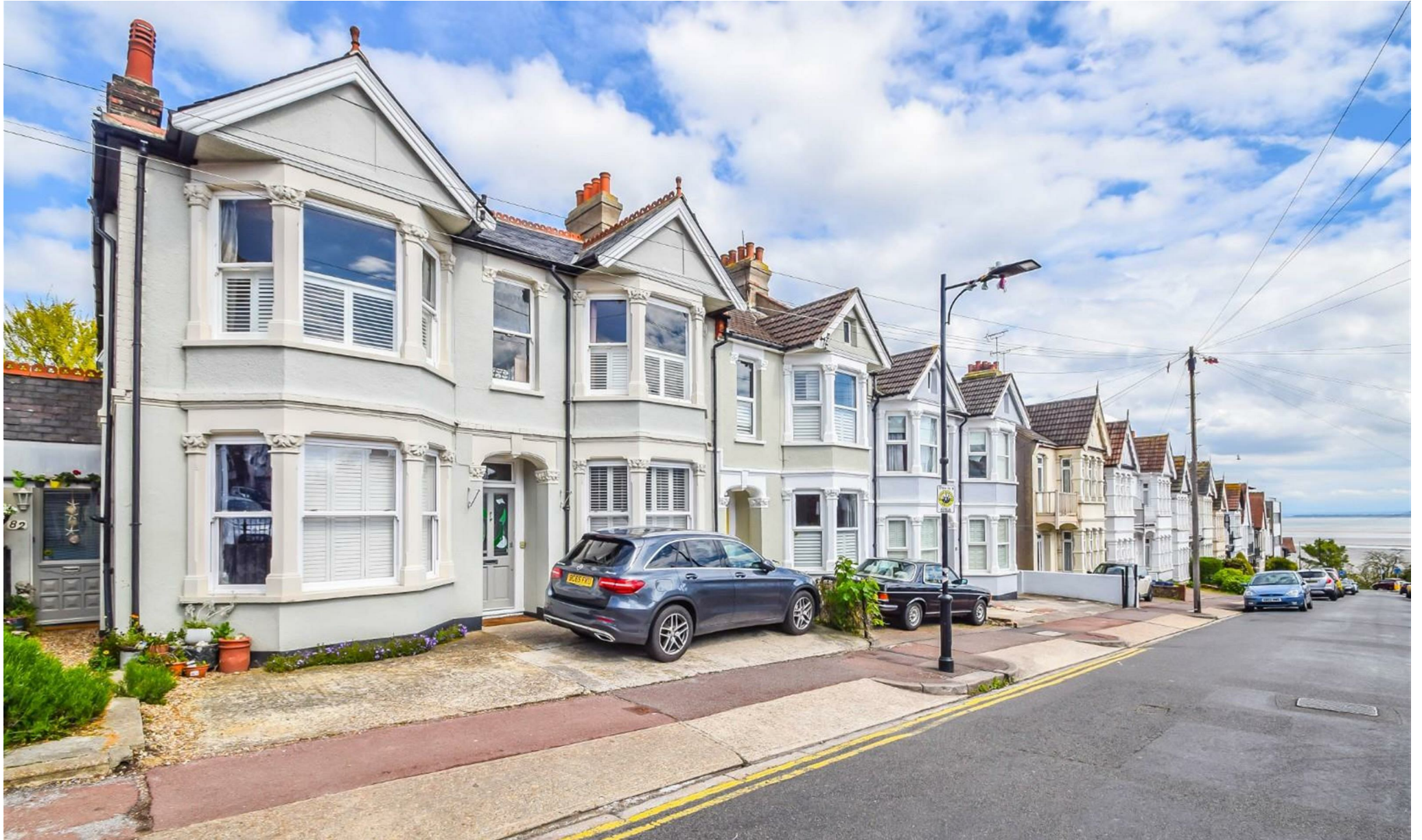
Woodfield Road, Leigh-On-Sea £469,000